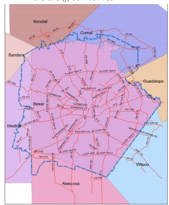
CPS Energy Service Area

For a project at a specific facility to be eligible for financial incentives in the program, the meter number must be provided in order to verify CPS Energy provides electric service for the facility.